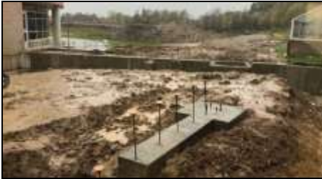
Footings of new multimedia center.

Cedar Springs Public Schools continue to see big changes on their campus as bond work stays on track, and in some cases ahead of schedule.